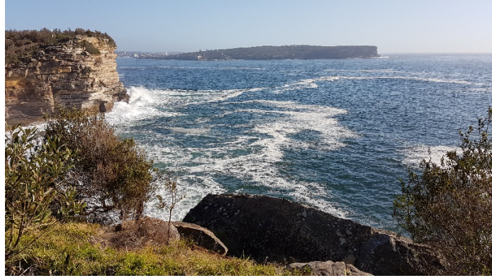
Sydney Harbour entrance – looking north from South Head to North Head