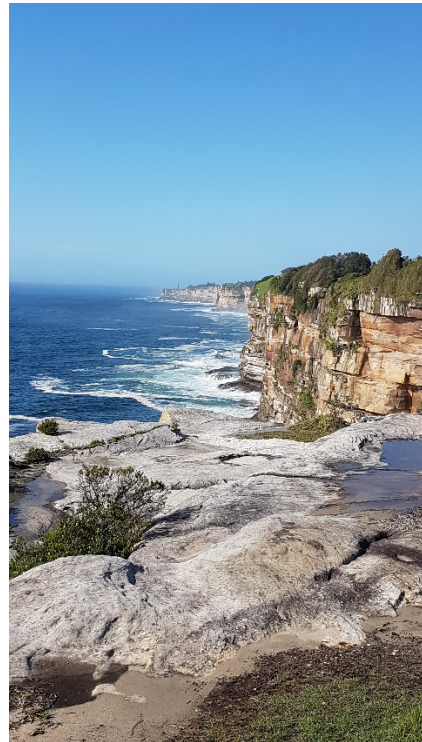
South Sydney coast cliffs