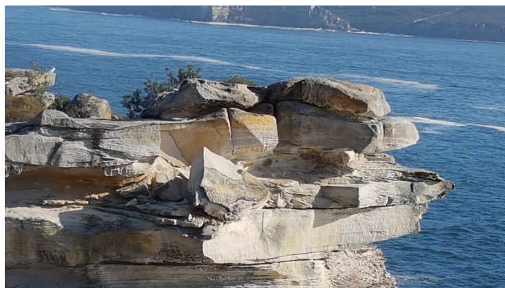
Cliff erosion near South Head.